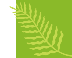
Lush vegetation in Lancang plantations